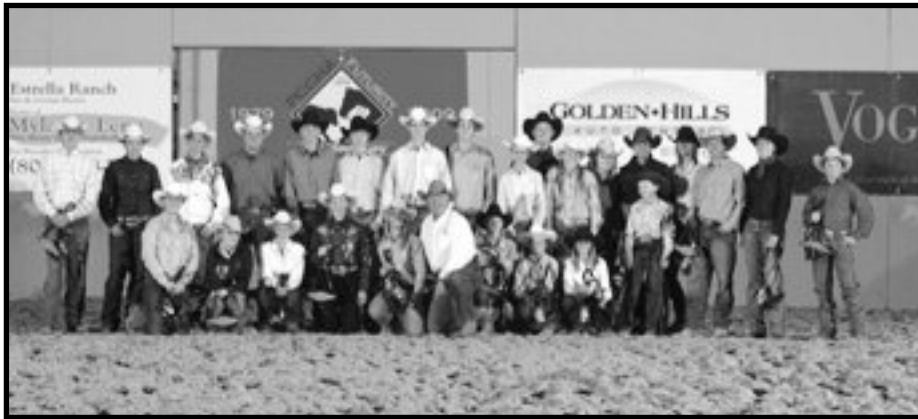
The 2009 PCCHA Youth Invitational Contestants